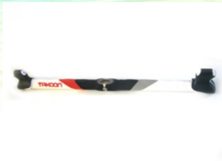
1-Get your new replacement bar.