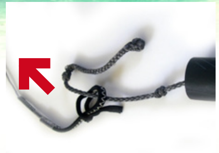
2- Remove lines and lead lines.