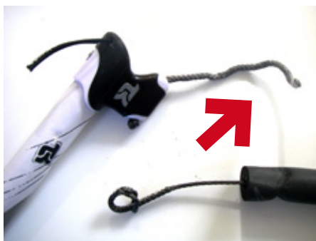
6 - Do this operation backward on the replacement bar.