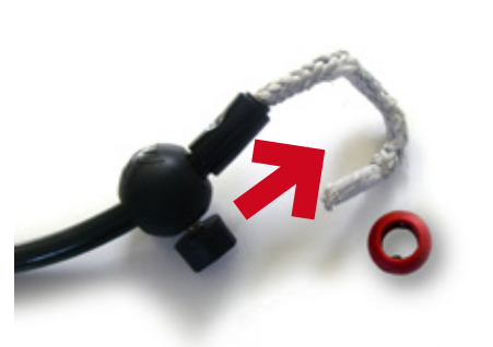
4-Remove the stoper ball.