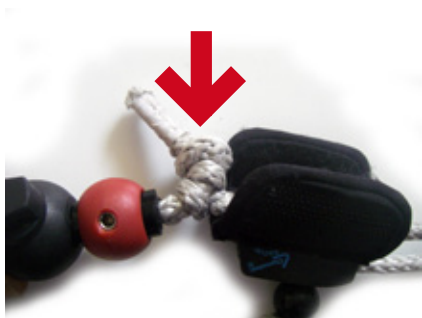
3-Undo the knot below the clam cleat.