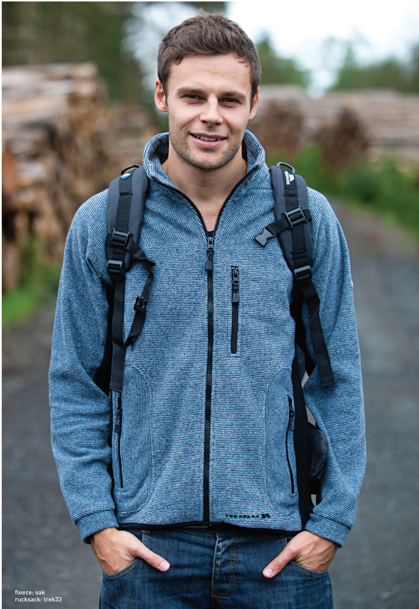
fleece: oak rucksack: trek33