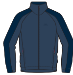
NAVY TONE NAVY