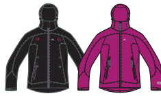
BLACK PASSION PINK BEETROOT GRAPHITE

Tricot Lining Adjustable Grown On Hood 2 Water Repellent Zip Pockets Audio Pocket/Channel Communications Pocket Drawcord at Hem Flat Cuff with Velcro Tab