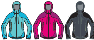
BLUEWAVE SPA PEAR