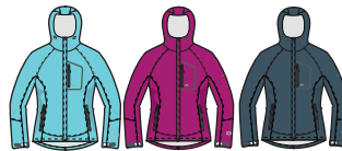
AQUA BEETROOT GRAPHITE

Shell: 2 Layer Fabric Adjustable Grown On Hood 3 Water Repellent Zip Pockets with Welded Tape Hem Drawcord with Side Adjustment Flat Cuff with Velcro Tab Chin Guard