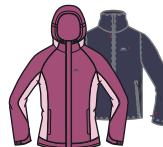
CHERRY CRUSH ROSE