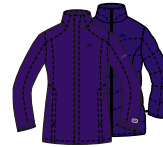
WILDBERRY WILDBERRY INNER