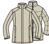
FAWN FAWN INNER