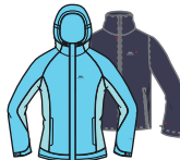
BLUE WATER POOL BLUE