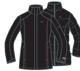
BLACK BLACK INNER