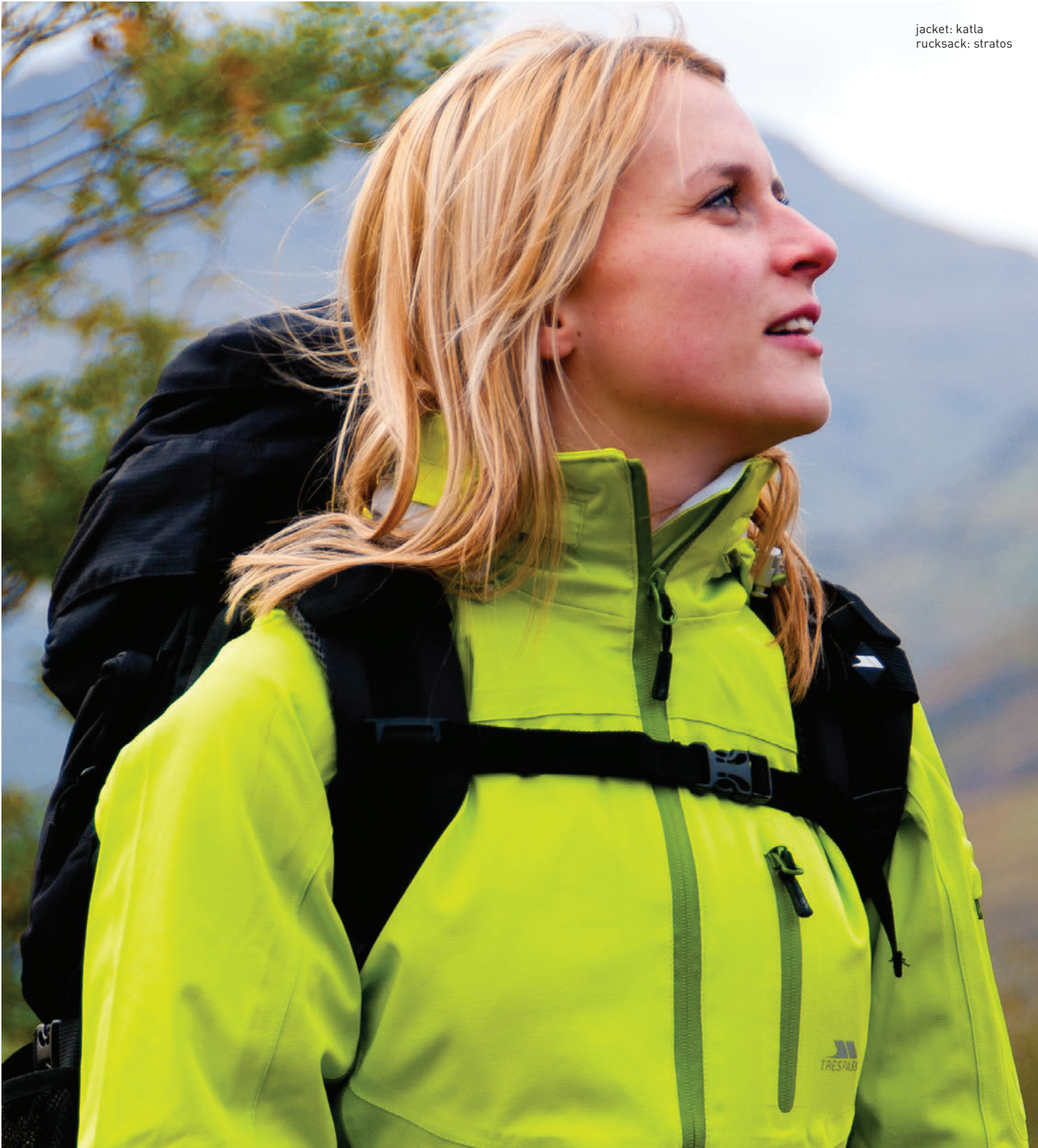
jacket: katla rucksack: stratos