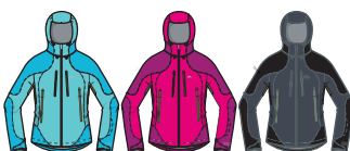
BLUEWAVE SPA PEAR