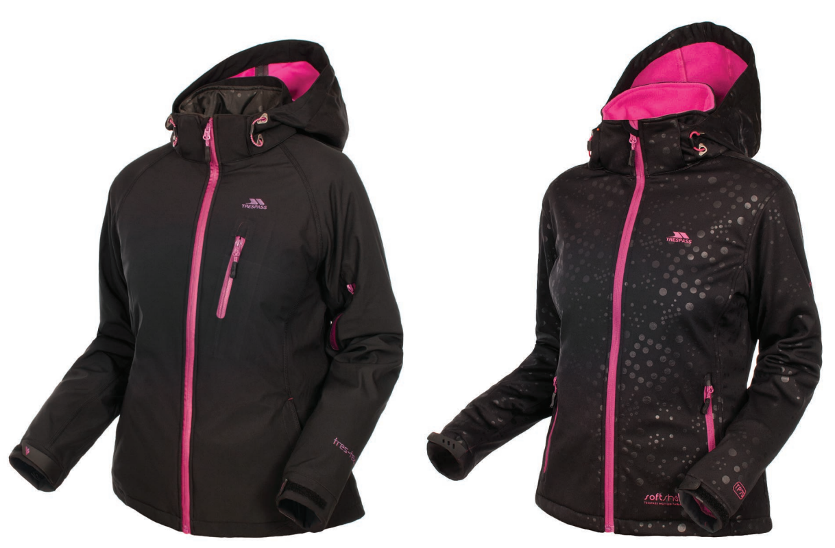
softshell 3in1 jacket: minturn

All available in: XS, S, M, L, XL, XXL Selected styles available in XXS