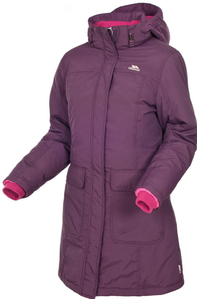
long length jacket: enclosed