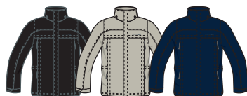
BLACK MUSHROOM NAVY