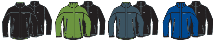
BLACK FERN FERN BLACK GRAPHITE FERN SAPPHIRE BLACK