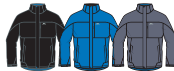
BLACK COBALT COBALT BLACK SLATE COBALT