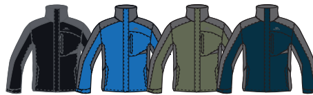
BLACK LEAD BLUE TONE LEAD CAPER LEAD NAVY LEAD