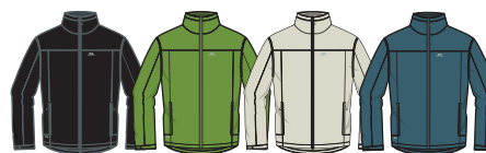
BLACK FERN STONE MILITARY BLUE