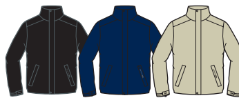
BLACK NAVY STONE