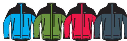
ATLANTIC BLACK FERN BLACK FIESTA BLACK GRAPHITE BLACK