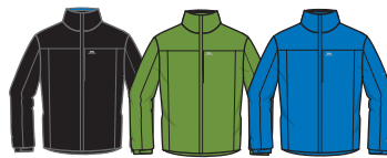
BLACK BLACK SPINACH BLACK COBALT BLACK