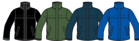
BLACK FERN NAVY ROYAL