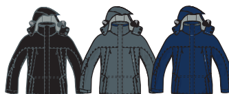
BLACK FLINT FLINT FRENCH NAVY FRENCH NAVY FLINT