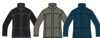
BLACK EARTH NAVY

TRES-SHIELD WATERPROOF & WINDPROOF FABRIC