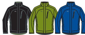
BLACK CACTUS CACTUS BLACK SAPPHIRE BLACK