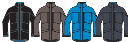
BLACK COBALT CHOCOLATE BLACK COBALT BLACK FLINT COBALT