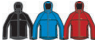
BLACK COBALT RED