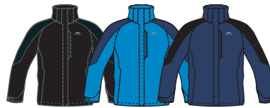
BLACK BLACK COBALT TWILIGHT TWILIGHT BLACK