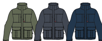
CAPAR FLINT NAVY