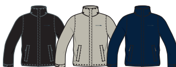
BLACK MUSHROOM NAVY

TRES-SHIELD WATERPROOF & WINDPROOF FABRIC