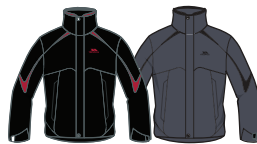
BLACK RED SLATE BLACK