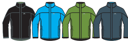
BLACK FERN ATLANTIC BLACK FERN BLACK GRAPHITE ATLANTIC