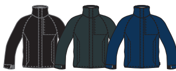
BLACK FLINT NAVY