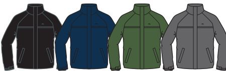
BLACK NAVY OLIVE ZINC