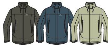
BARK GRAPHITE PUTTY