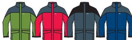
FERN GRAPHITE FIESTA GRAPHITE GRAPHITE BLACK INDIGO GRAPHITE