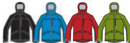
BLACK COBALT RED CACTUS