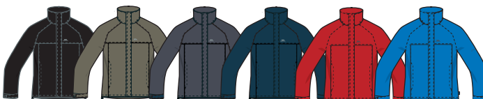
Y BLACK Y EARTH Y FLINT Y NAVY Y RED Y ROYAL