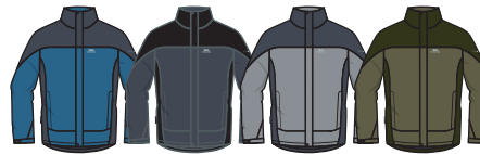
BLUETONE FLINT FLINT BLACK SMOKE FLINT VINE MARSH