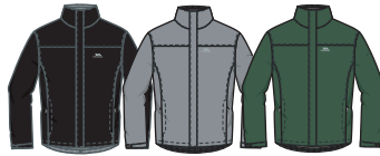
Y BLACK SMOKE Y SMOKE BLACK THYME BLACK