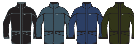
BLACK GRAPHITE TWILIGHT VINE