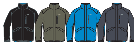
BLACK COBALT CHOCOLATE BLACK COBALT BLACK FLINT COBALT