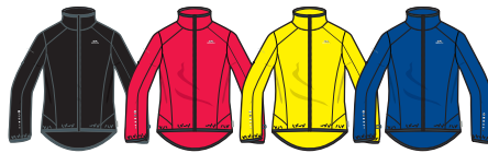
BLACK FIESTA HI-VIS YELLOW SAPPHIRE