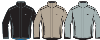
Y BLACK COBALT FAWN BLACK Y SMOKE BLACK