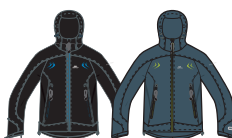
BLACK COBALT GRAPHITE WASABI