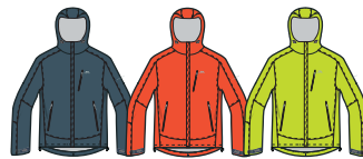
GRAPHITE GRENADINE WASABI