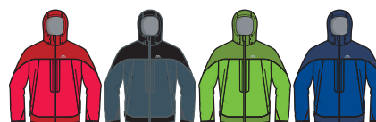
FIESTA BRICK GRAPHITE BLACK LEAF FERN SAPPHIRE TWILIGHT