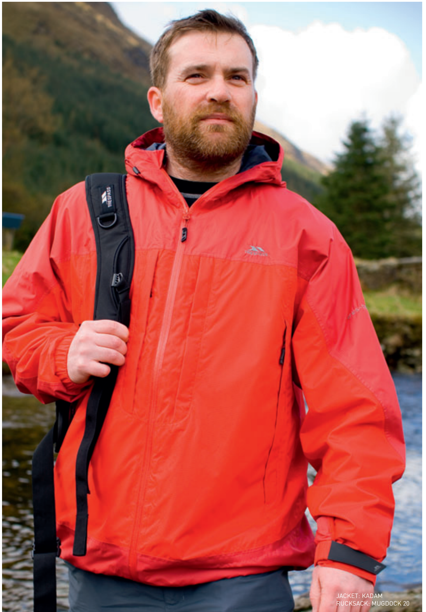
JACKET: KADAM RUCKSACK: MUGDOCK 20