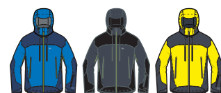
COBALT TWILIGHT KIWI FLINT BLACK KIWI LIMONE FLINT SMOKE