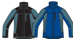
BLACK LEAD ROYAL BLUE LEAD