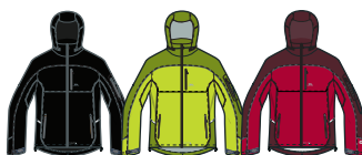
BLACK BLACK CACTUS WASABI PAPRIKA SHIRAZ