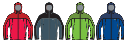
FIESTA BRICK GRAPHITE BLACK LEAF FERN SAPPHIRE TWILIGHT