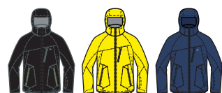
BLACK KIWI LIMONE FLINT TWILIGHT COBALT