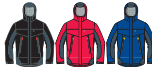
BLACK FIRE FIESTA SMOKE SAPPHIRE YELLOW