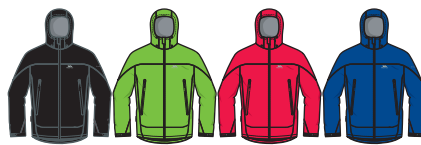
BLACK FERN FIESTA SAPPHIRE