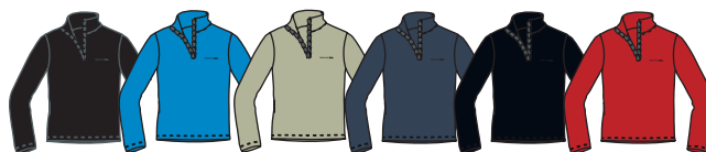
Y BLACK Y COBALT Y FAWN Y FLINT Y NAVY Y RED