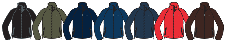
BLACK Y KHAKI Y NAVY Y PITCH BLUE Y SHADOW Y SIGNAL RED Y TRUFFLE