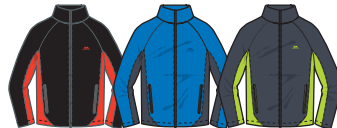
BLACK COBALT FLINT FIRE FLINT KIWI